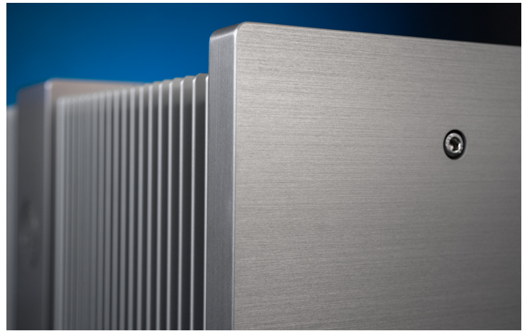
With the Mono VI, Accustic Arts has once again increased the robustness of the housing. The front is now a full 19 millimetres thick - this continuing to impress with the fine chamfering of the edges, the line pattern of the brushed aluminium and the soft shimmer of the refined surface.

the transformers now have a maximum output of 1,900 volt-amperes. With this added potency and even greater reserves, they offer even better conditions for extremely high and fast power delivery. Only this enables outstanding dynamic capability and relaxed operation - even with large and sudden level peaks. In line with this, the subsequent current screening is also maximised: With a large number of premium capacitors and a total capacity of now 110,000 microfarads, it guarantees excellent voltage smoothing and a highly constant energy supply.