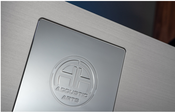
Elegant design: The mirror-smooth, high-gloss chrome trim is set into the front like a precious inlay and presents the engraved seal-like Accustic Arts logo.