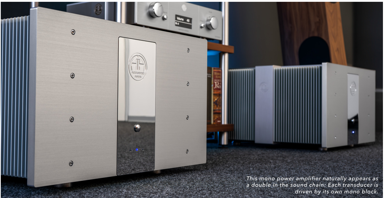
This mono power amplifier naturally appears as a double in the sound chain: Each transducer is driven by its own mono block.

Let's take advantage of the next opportunity offered by the Mono VI: It also accepts the signal from a preamplifier whose output is not AC-coupled but DC-coupled. That means: The preamplifier output does not require the coupling capacitor and resistor used for protection. That means there are fewer components in the signal path that influence the sound, which can be advantageous in terms